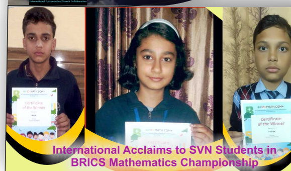
International Acclaims to SVN Students in BRICS Mathematics Championship