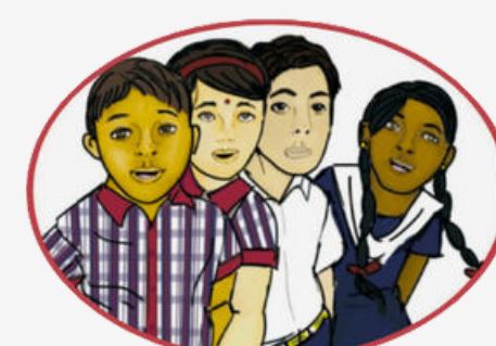
KVII Sc Alumni Association

By the Mentors of Change associated with Atal Innovation Mission, NITI Aayog, Govt. of India